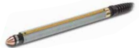
T45m machine torch