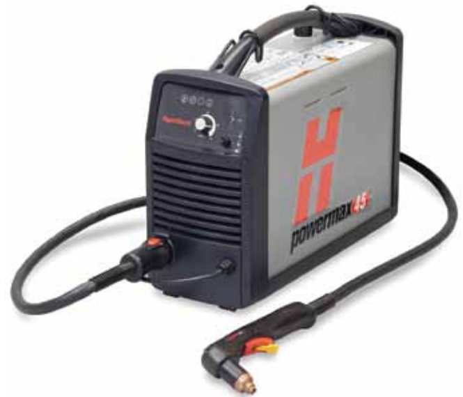
T45v hand torch