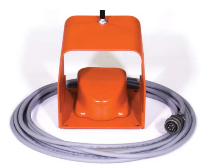
Hydraulic Accessory Tool Foot Pedal