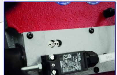
Blade Tension Indicator